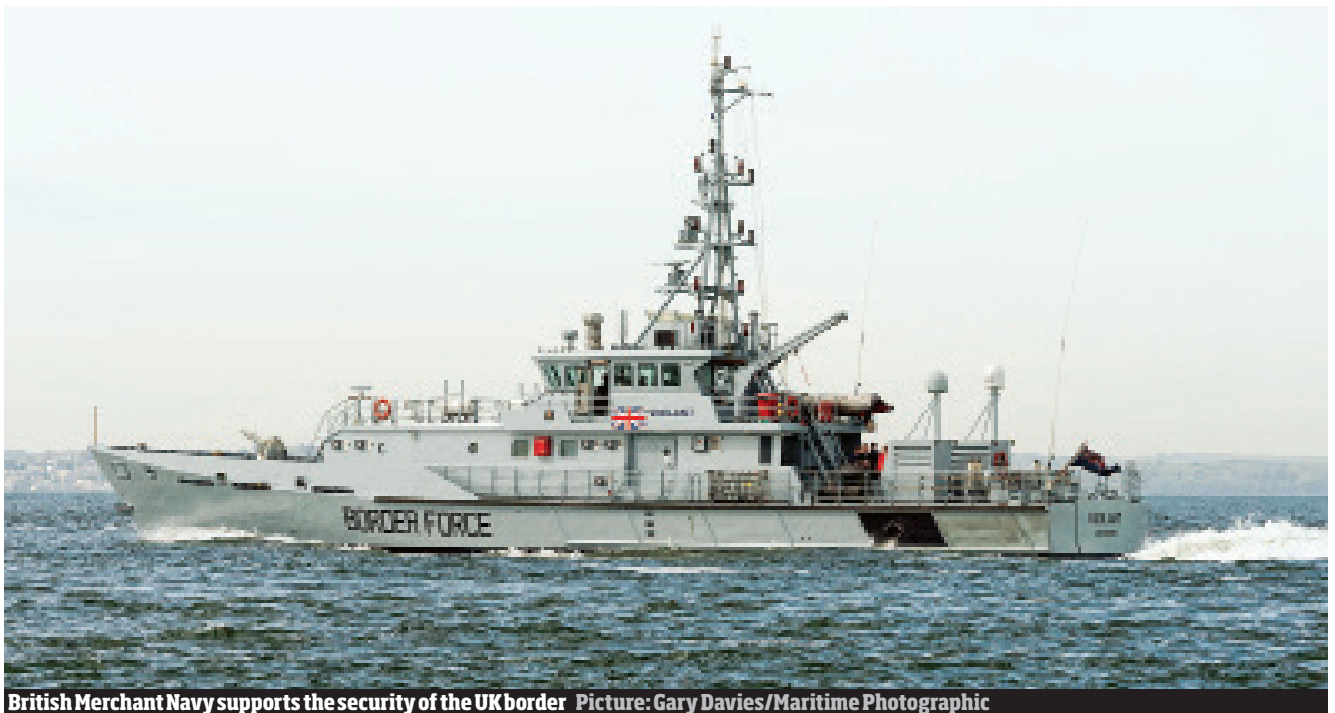
British Merchant Navy supports the security of the UK border

A strong Merchant Navy is prerequisite for a strong Royal Navy in the interests of the economic and strategic interests of the UK. A UK version of the US Jones Act would ensure this.