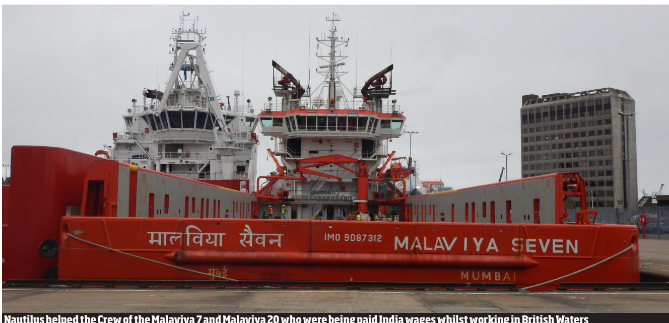
Nautilus helped the Crew of the Malaviya 7 and Malaviya 20 who were being paid India wages whilst working in British Waters

This currently represents the most effective way to tackle pay rates in the shipping industry that fall below the National Minimum Wage and the newly introduced National Living Wage because of the understandable reluctance of the affected seafarers to complain directly to the UK's governmental agencies.