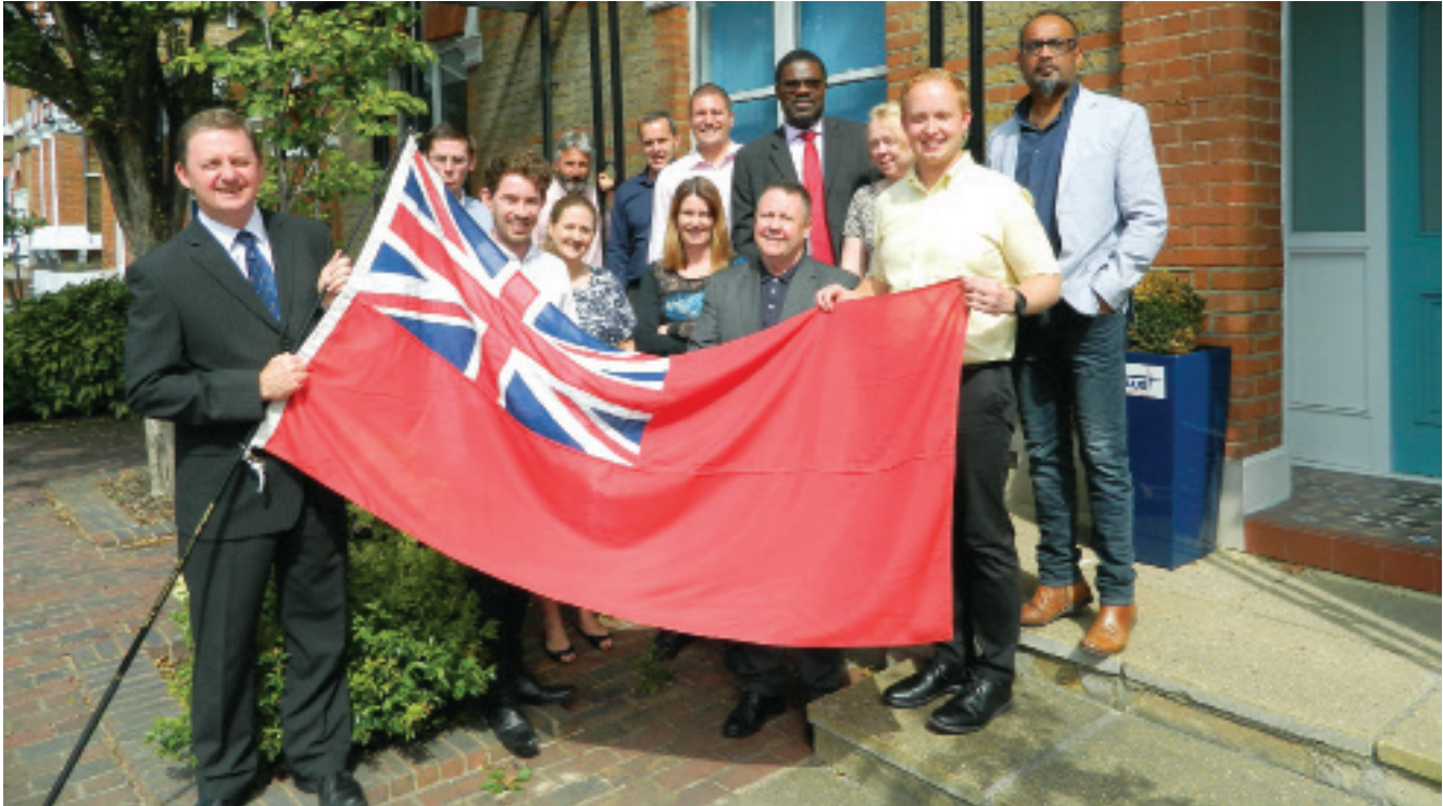
Nautilus head office personnel came out to honour the red ensign on 2 September, the nearest working day to Merchant Navy Day this year – and they were joined in their celebration of shipping by colleagues visiting from the Nautilus Netherlands office.

The Red Ensign Group (REG) is a group of ship registers that adopt the Red Ensign or a defaced version. Category one registers — unlimited tonnage and type — include the UK, Isle of Man, Bermuda, British Virgin Islands, Cayman Islands and Gibraltar. Category two registers — commercial ships and yachts of up to 150 gross tons and vessels which are not operated commercially of up to 400 GT — include Guernsey, Jersey, Anguilla, Falkland Islands, Montserrat, St Helena and the Turks & Caicos Islands.