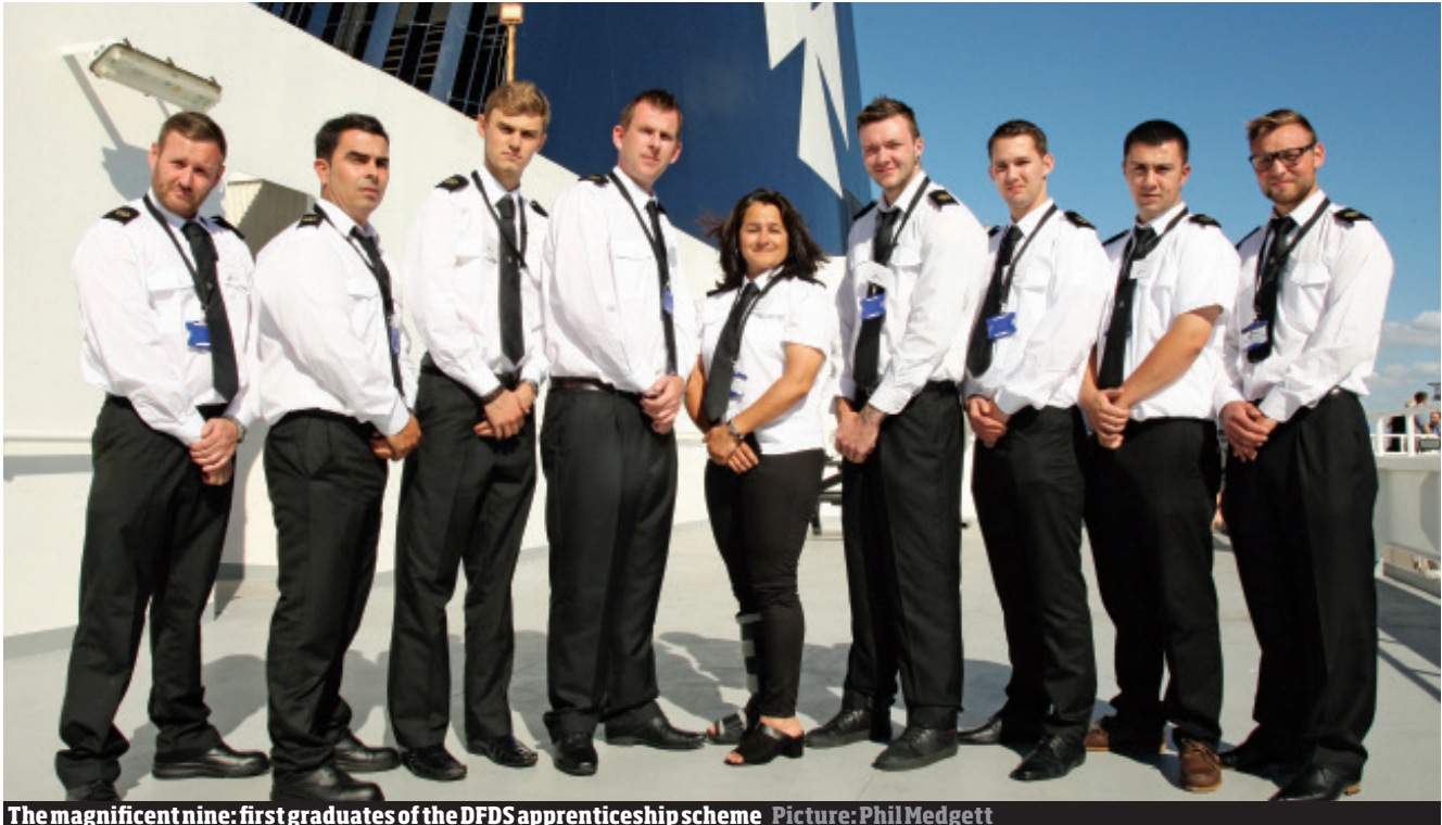
The magnificent nine: first graduates of the DFDS apprenticeship scheme

Once the UK is out of the EU, the government will be free of the restrictions laid down by the State Aid Guidelines, providing an opportunity to support officers once they have achieved their first certificate and enabling them to take full advantage of the sector's desire for UK-trained senior officers.